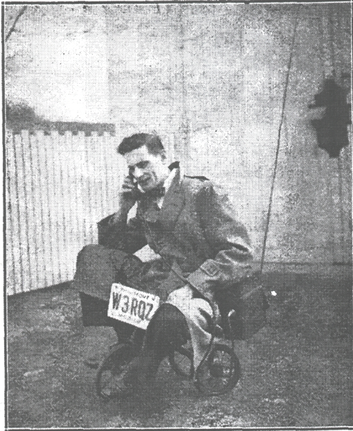
Phil-Mont's entry for the World's Smallest Mobile.

which can be transported to locations not accessible by automobile. This problem was solved by W3JLE, who constructed a "walkie-talkie." Since batteries are the source of power for such equipment, a compromise must be reached between power output, size, and weight. The power input of this particular unit is 375 milliwatts; nevertheless, it provides a communication link which is reliable up to approximately three miles.