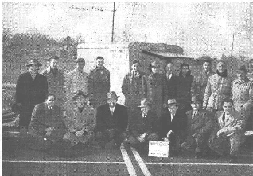
Some of the members gather outside the trailer at a recent CD exercise. Standing (l. to r.) W3CTT, W5NYA, W3QFY, W3VVS, W3GIF, W3UXP, W3AAG, W3QQH, W3NIP, W3UIX and W3HYU. Kneeling (l. to r.) W3EXY, W3IM, W3SGR, W3JGB, W3IW, W3FFP and W3XPY.